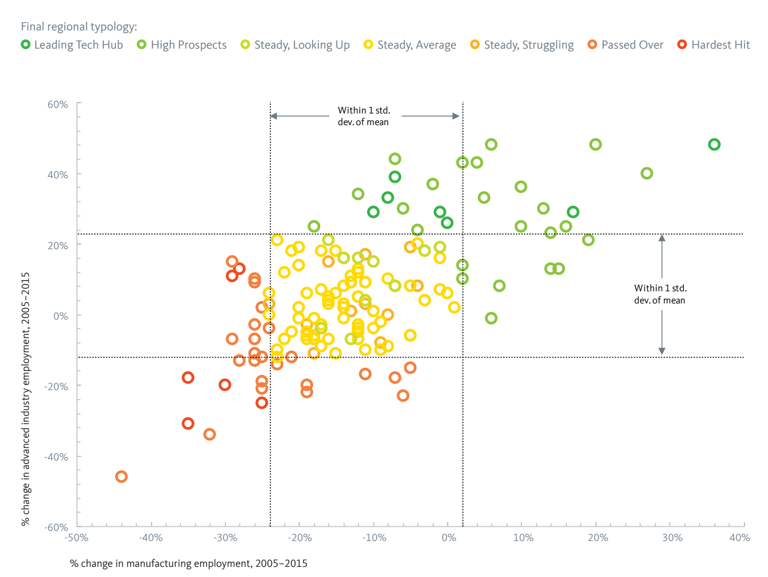
Figure 5. Grouping regions into final regional typology, 150 largest metropolitan statistical areas